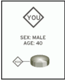
Fig. 1 DISC PERSONALITY